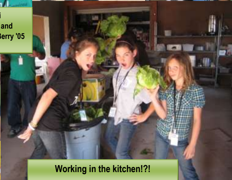
Working in the kitchen!?!